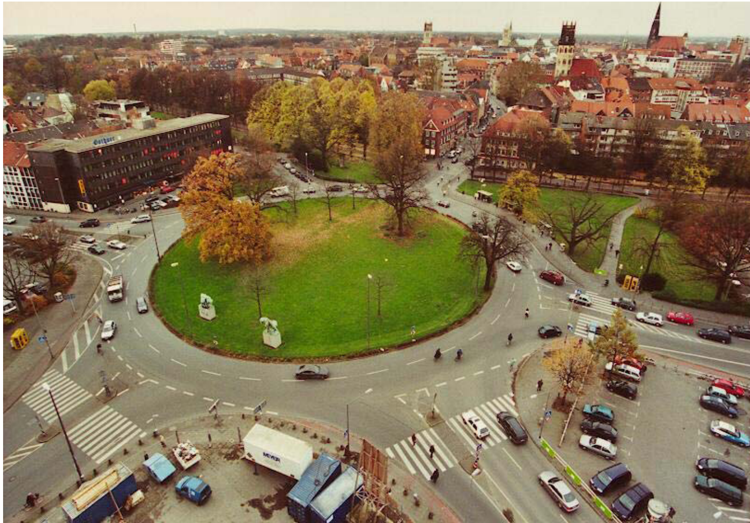
Ludgeriplatz in Muenster

How are the activities of group living individuals coordinated at this roundabout?